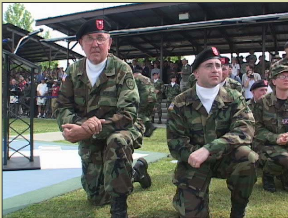
ABOVE: GSDF troopers survey the scene as family members of Guardsmen watch the sendoff ceremonies. BELOW: Georgia Governor Sonny Perdue gets a GSDF welcome at Ft. Stewart.

On May 13 & 14 members of the GSDF 3 rd BDE and other GSDF units helped send off the Georgia National Guard's 48 th Infantry Brigade before they deployed overseas for a tour of duty in Iraq. GSDF provided crowd and traffic support, media supervision, and VIP escort during formal sendoff ceremonies at Ft. Stewart. "Today's ceremony is not about saying goodbye," said Gov. Sonny Perdue. "It's about celebrating the courage each of you display."