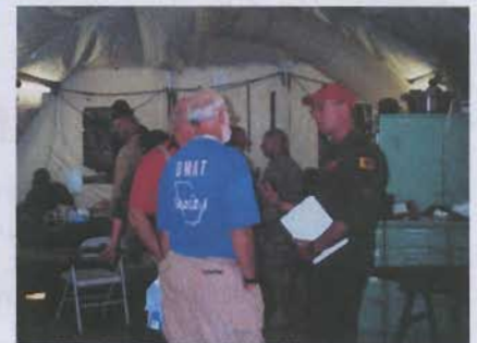
Below: Exercise participants confer in the EMEDS Mobile Hospital.